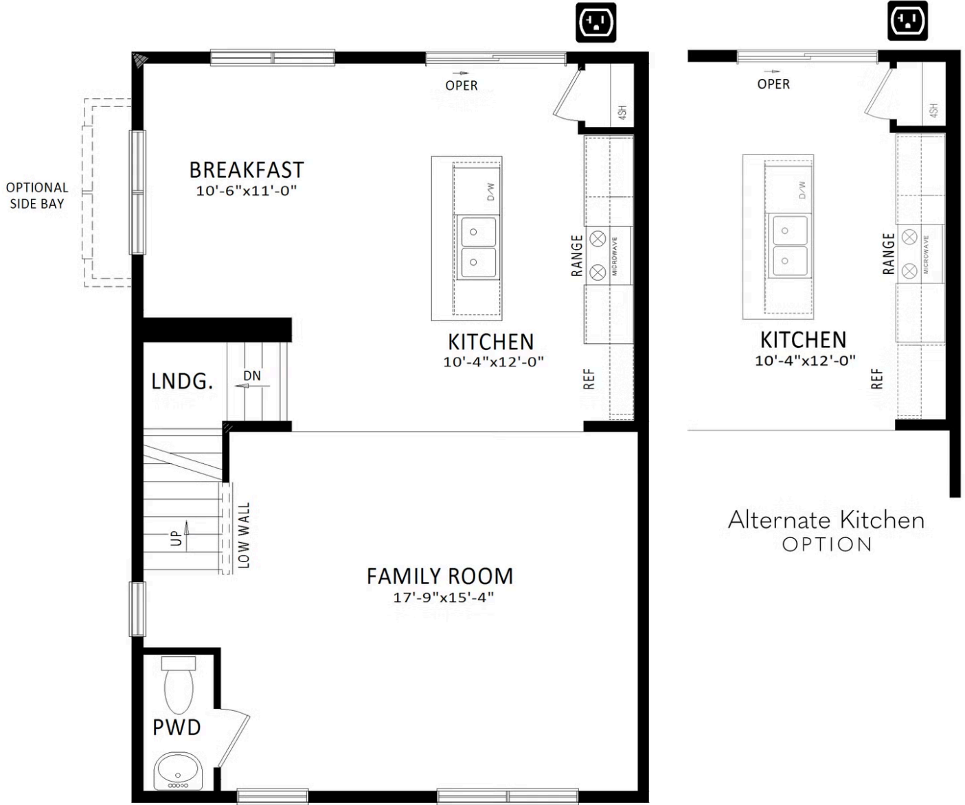
ELEVATIONS "A" & "D"