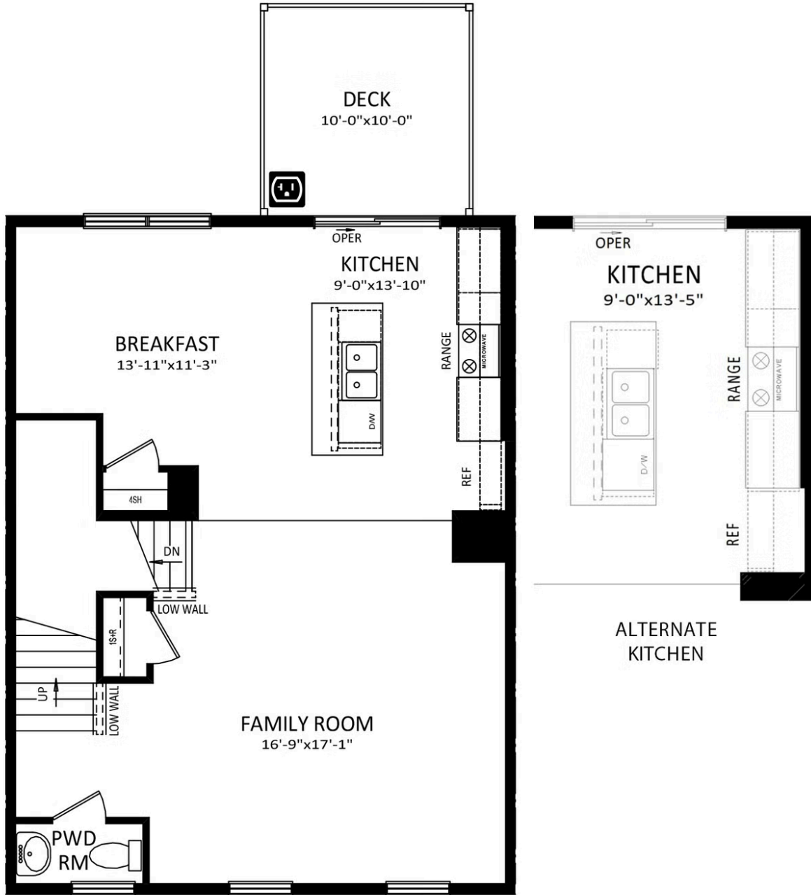
ELEVATIONS "A" & "B"