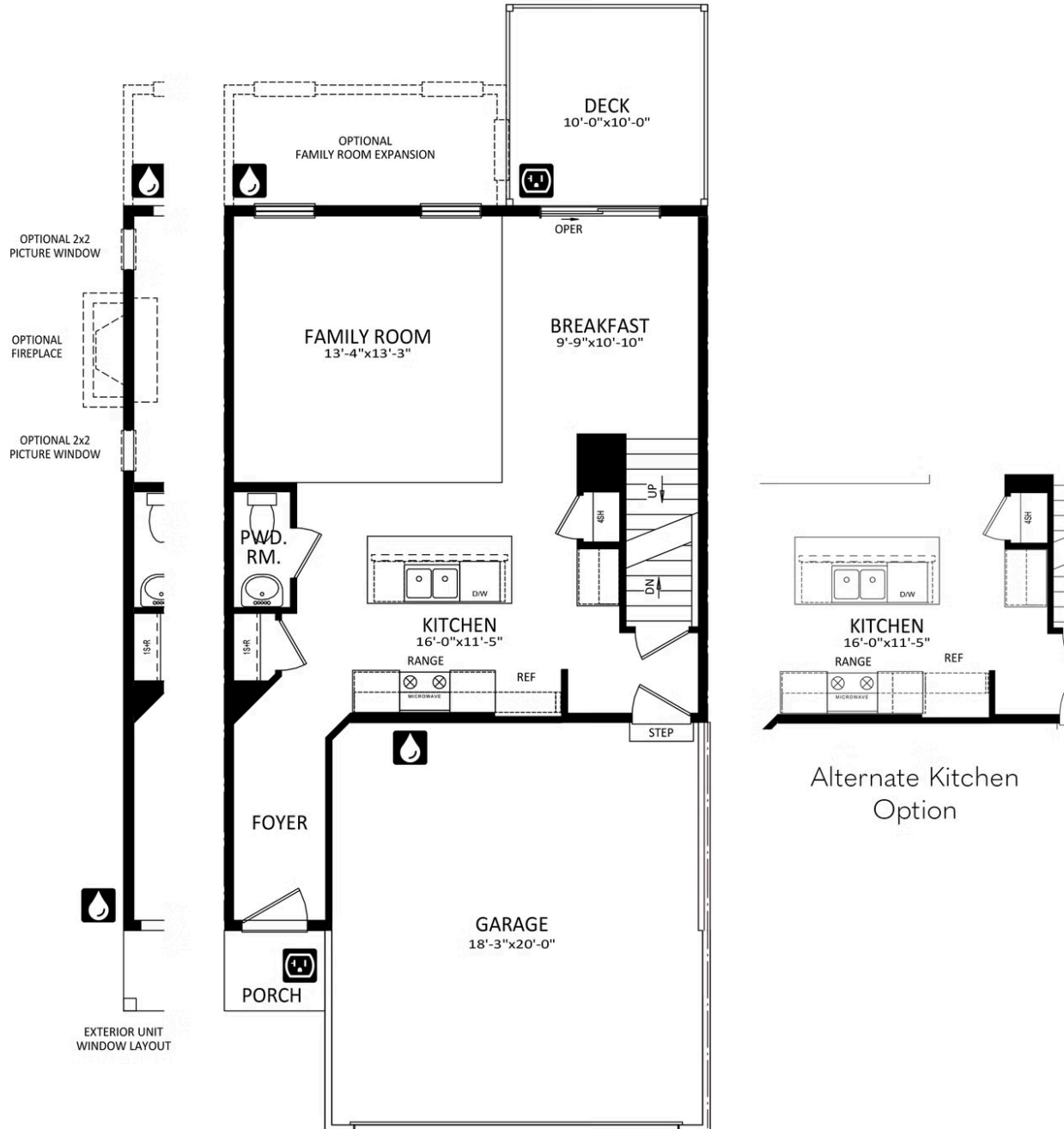
LILY FIRST LEVEL